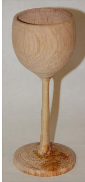
Small Red Oak goblet, unfinished—Kevin Wood