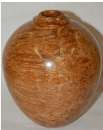
Big Leaf Maple burl vessel—Harvey Meyer