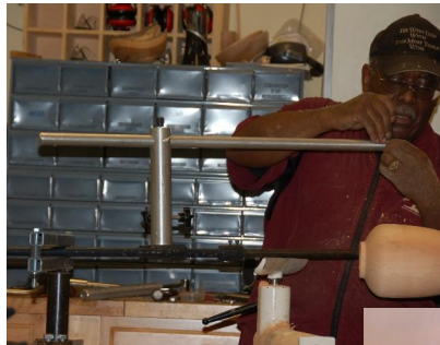
Using a captive bar hollowing tool with laser guide