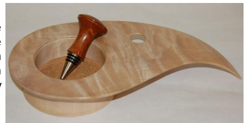
Curley Maple wine bottle coaster with stopper—Jim Hardy