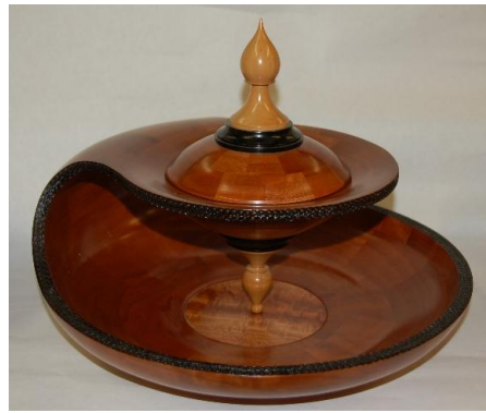
Large segmented serving bowl (originally a vessel) with finial on top and inside. Made from Makore, Ivorywood, and Gabon Ebony.