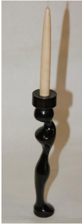
Small Cherry dyed, multi-axis candle holder—Michael Gibson