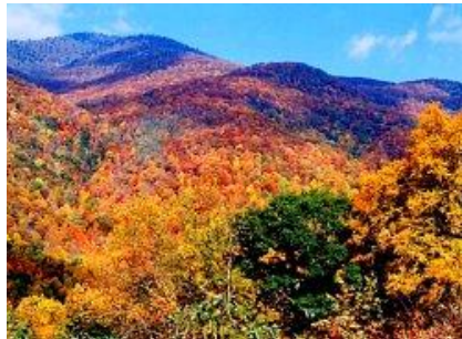
North Ga Mountains