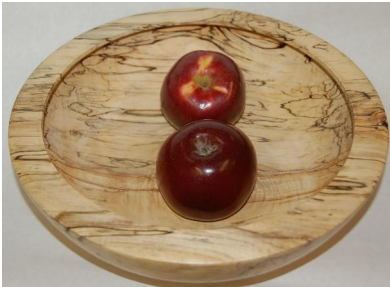
Large spalted Sweet Gum bowl (with apples) - Roger Sword