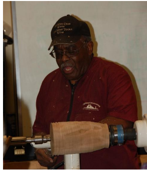
Starting to shape the outside of the vessel