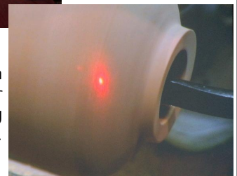
Close up of laser light on outside of vessel—for consistent hollowing thickness.