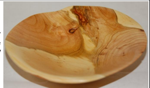
Small Cherry dish—George Daughtry