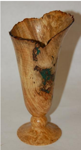
Box Elder burl vase with foot and natural edge and Turquoise inlay—Harvey Meyer