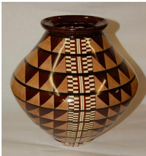
Segmented vessel made of Maple, Wenge, Bloodwood, Tazmanian Blackwood, Holly and black veneer—Al Fox