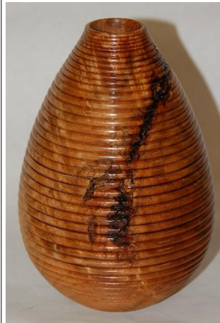
Big Leaf Maple burl beaded vessel—Harvey Meyer