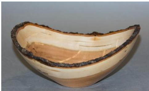
Cherry bowl natural edge bowl—Harvey Meyer