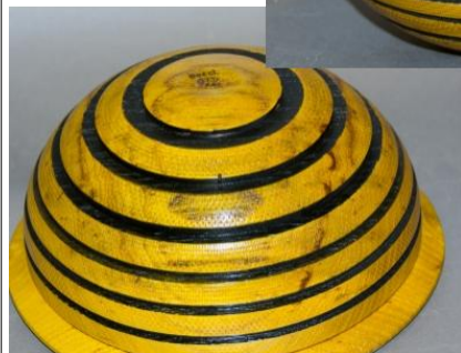
The outside / underside