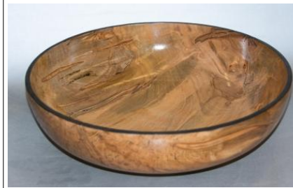
Ambrosia Maple bowl with black rim—Turk Aliston