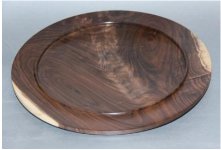
Walnut crotch platter—Harvey Meyer