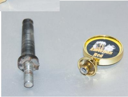
Custom beer tap centering jig and tap top—