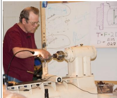
Chasing the threads