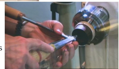
Chasing the threads