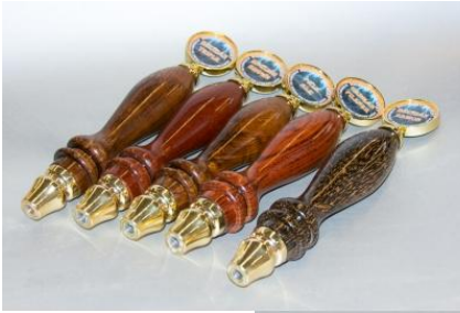
Hand turned beer taps—