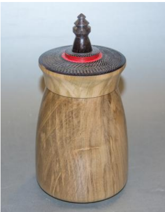
Ambrosia Maple lidded box with texturing and coloring—George Daughtry