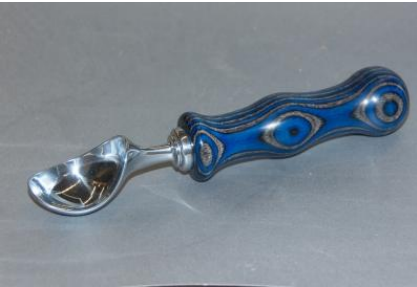
Laminated and dyed ice cream scoop—Wes Jones